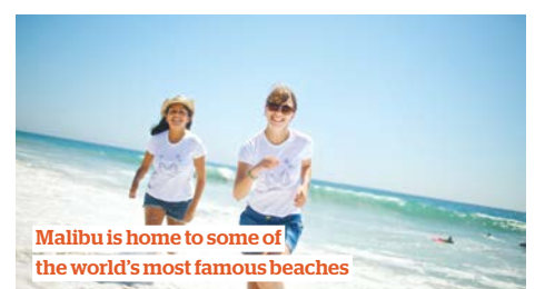
Malibu is home to some of the world's most famous beaches