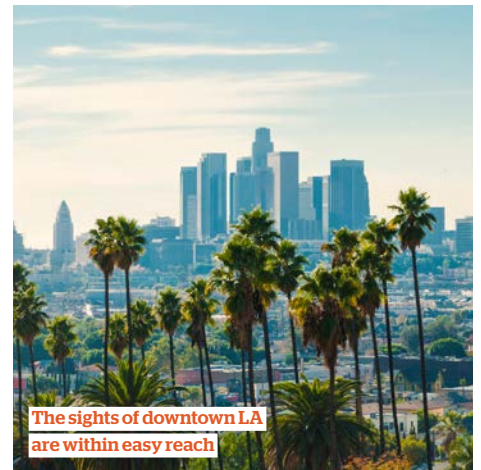
The sights of downtown LA are within easy reach