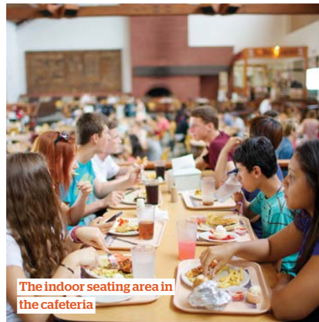
The indoor seating area in the cafeteria