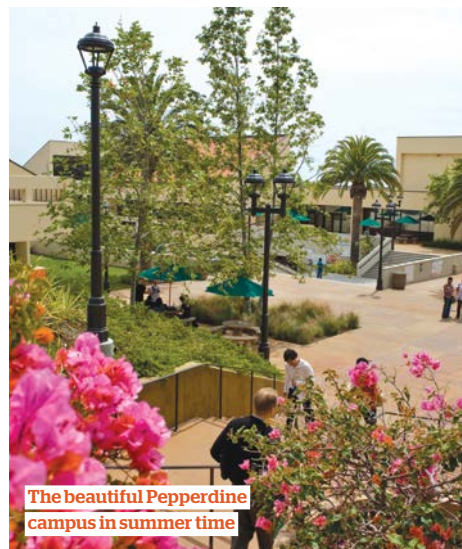
The beautiful Pepperdine campus in summer time

All excursions include a tour segment and some allocated shopping time (where available). Excursion entrances are included where shown on the timetable above. All excursions are led by Kings members of staff. Alternative excursions and entrances may be available upon request – contact Kings Summer for details.